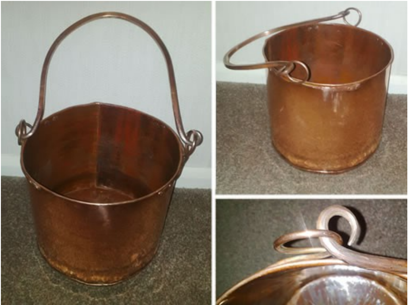
Traditional rolled seamed copper coal scuttles and log buckets. From £145