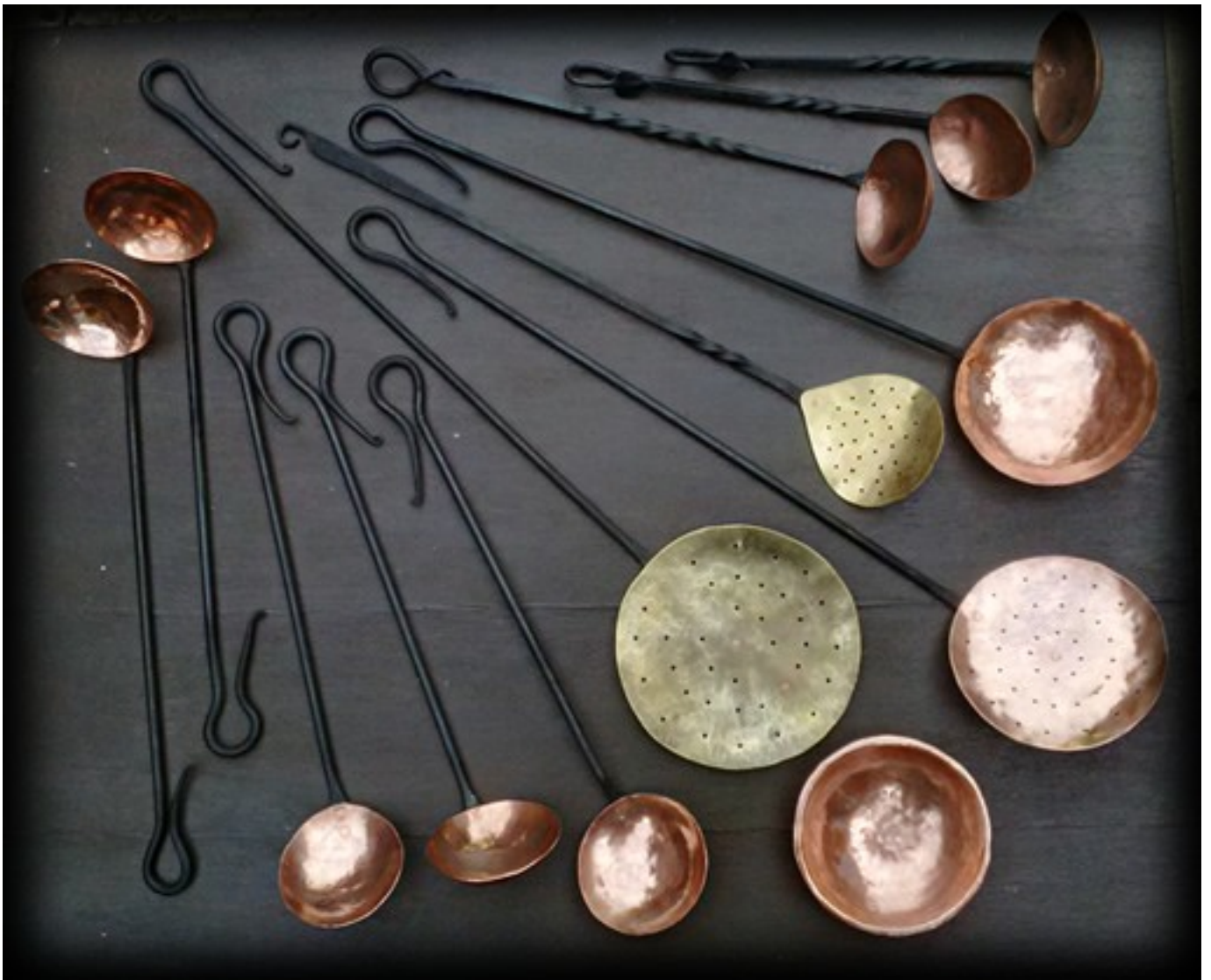
Ladles and skummers from £38.