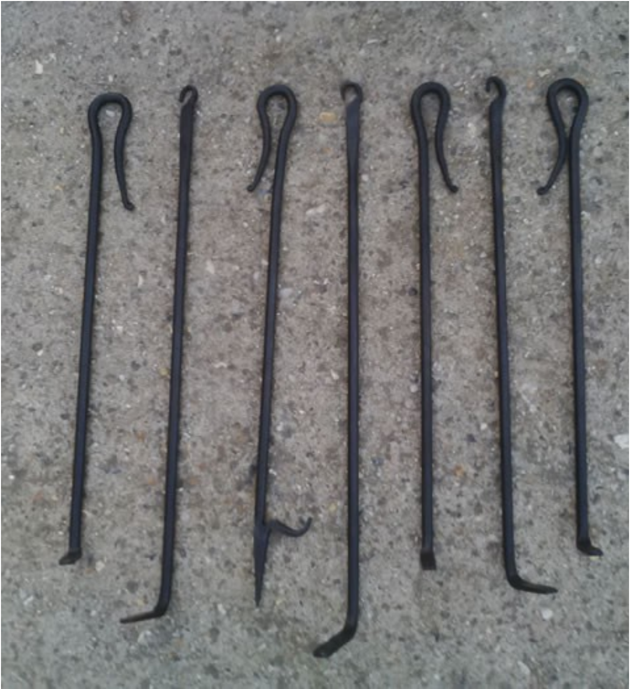
Pokers, Fire rakes & Log Turners from £12.00