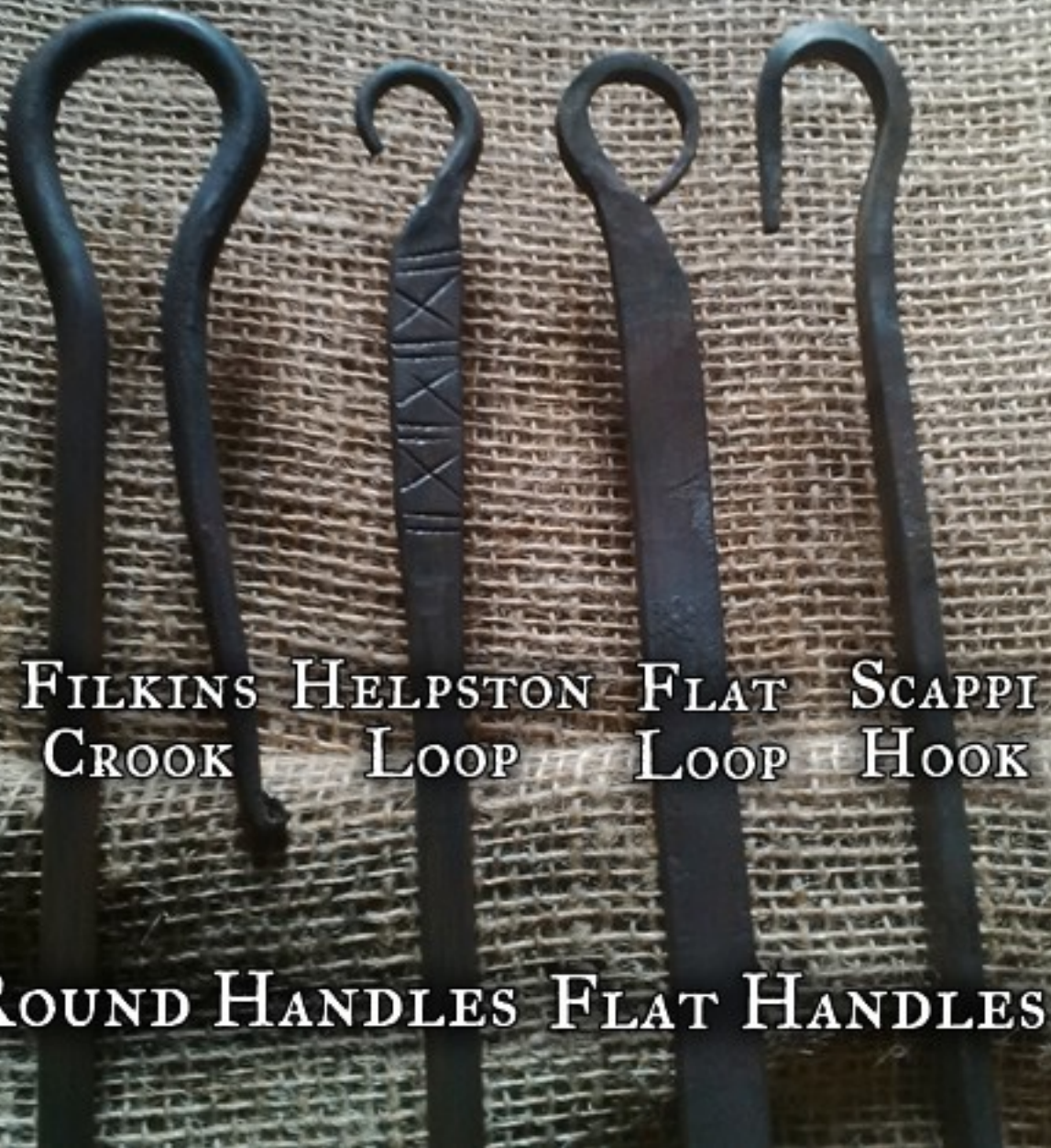
FILKINS CROOK HELPSTON LOOP FLAT LOOP SCAPPI HOOK