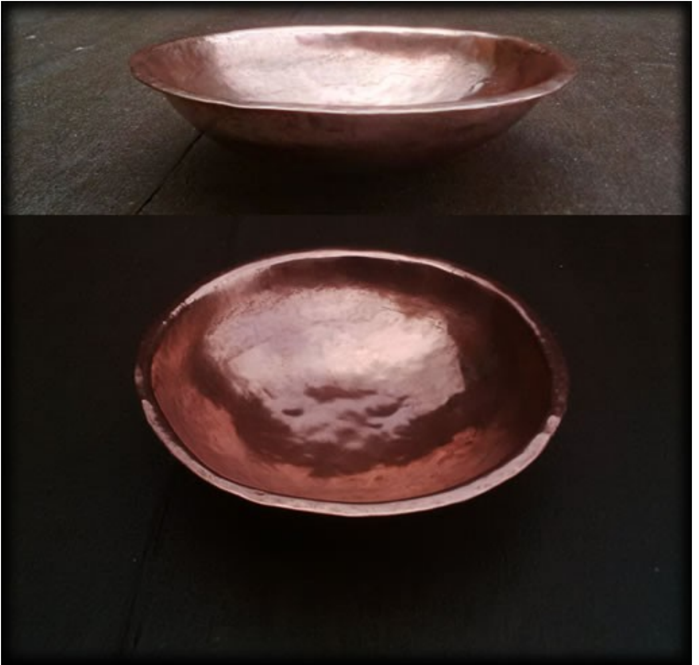
Hand beaten copper bowls with rolled edge rim. From £20,